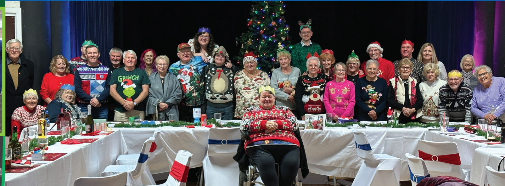
Covering Bromley Heath, Downend, Emersons Green, Fishponds, Frenchay, Lyde Green, Mangotsfield and Staple Hill